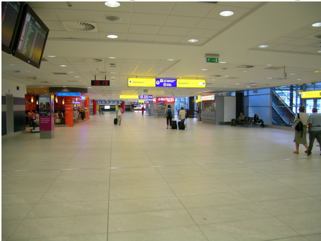
View from baggage claim hall exit