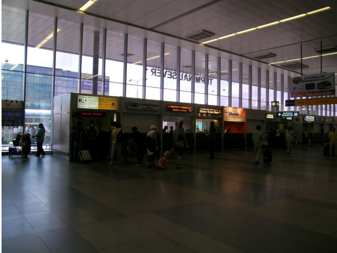
View from baggage claim hall exit